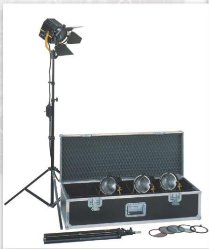
LKF2/FC: Flight Case version

Adding 1 Chimera Speedring (9650) and 1 Chimera Video Pro Bank Small, to the LKF2 and LKF2/FC change the model numbers respectively to LKF2/S and LKF2/S/FC