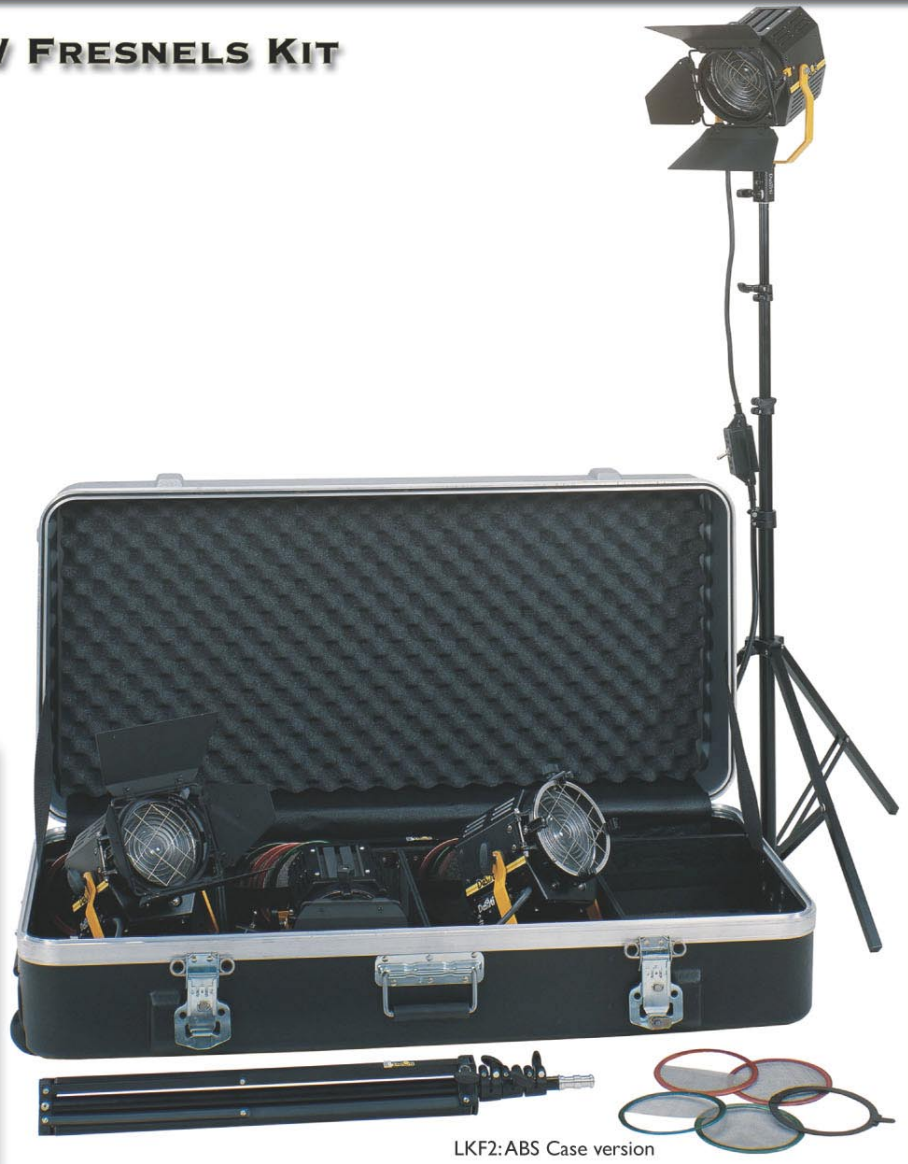
LKF2:ABS Case version