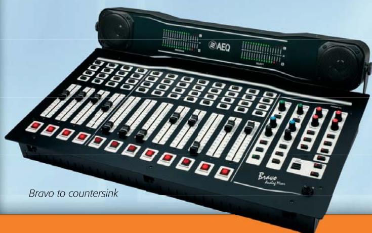
Bravo to countersink